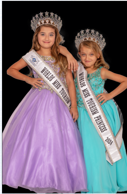
Worlds Pre-Teen Miss Tourism 2024 & Worlds Jr. Miss Tourism 2024