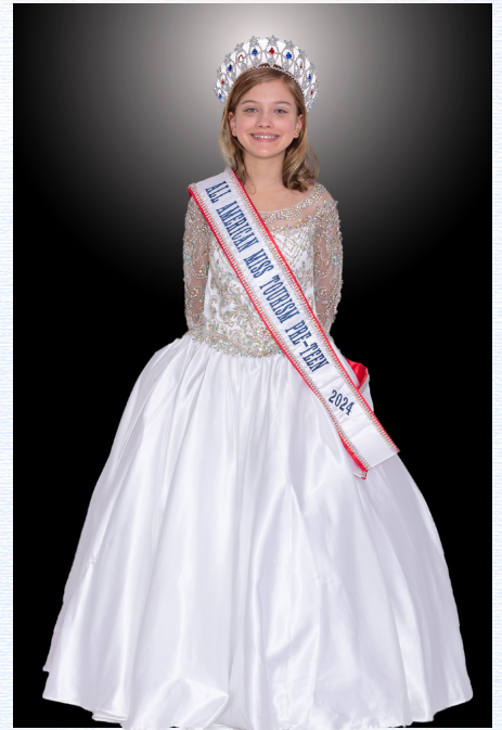
All-American Pre-Teen Miss Tourism 2024