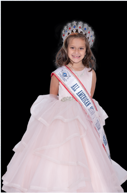
All-American Jr. Miss Tourism 2024